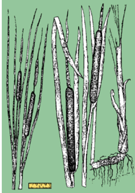
Figure 1. Cattails ( Typha latifolia L.) provide wildlife habitat while removing nitrate, lead, cadmium, cobalt, and zinc from water.