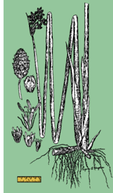
Figure 2. Bulrushes ( Scirpus spp.) are the workhorses of wetland water purifying plants. They remove bacteria, oil, organics, and nutrients. Rushes (not pictured) also remove heavy metals, including cobalt, copper, manganese, nickel and zinc.