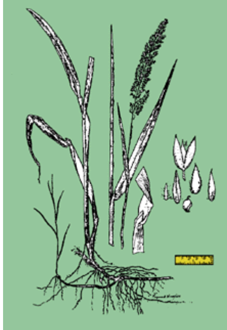
Figure 3. Reed canarygrass ( Phalaris arundinacea L.) is an excellent user of nitrate and can aid in the removal of mercury. It grows on the margins of wetlands and in wet pastures. However, it can be a weedy species. Do not use it to mitigate damage to a natural wetland.

A retention time of about 1 week in a wetland removes particulate matter from the water. At this speed, most sediments will settle out of the water. To remove nutrients and other soluble materials, a retention time of more than 2 weeks is desirable.